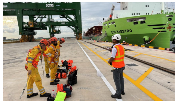
Safety measures and briefing before start of SIMOPS